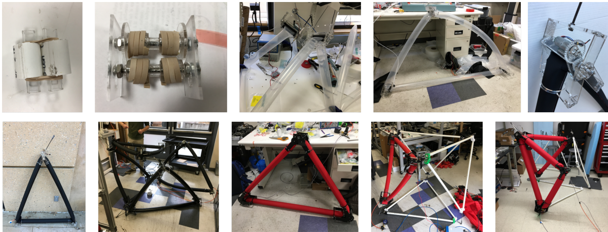
Fig. 2. Development of prototypes from the earliest proposed robotic roller (top left), to two triangles connected together into a PVC frame (bottom right).

was applied to a thin-walled inflated beam, it tended to buckle in a relatively small area, forming a region of low bending stiffness while the rest of the beam maintained its strength. We leveraged this fact by building roller modules that induced and controlled the position of these buckle points. This key realization led to the concept of the isoperimetric robot.